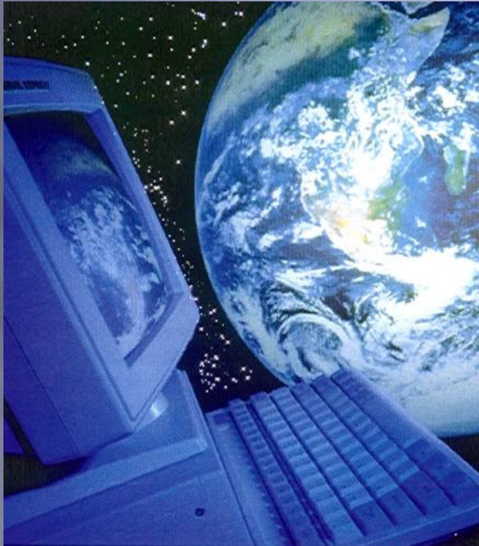
A single access point to the World Culture