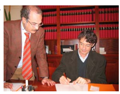
Signing the IGeLU Constitution in Siena, January the 9th 2006

Very few user organizations in the "library world" can offer something like this; very few of them are completely autono-