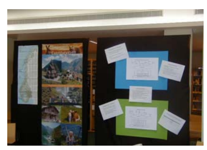
Poster from Norway at ICAU in Porto 2004

Please e-mail your proposals using the form to Gerard Bennett,: