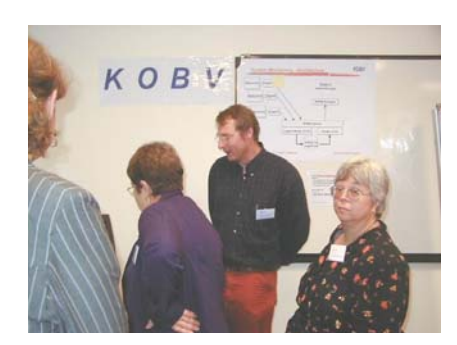
Poster from KOBV at ICAU in Paris 2002