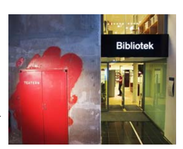
To the right is the entrance to the Library. The door to the left used to lead to a theatre but it isn't in use any more. It's only kept as a protected monument to the architect Peter Celsing.