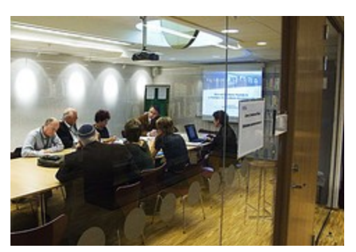
Discussion in Stockholm, IGeLU 2006

In a ground-breaking initiative, facilitated by the IGeLU and ELUNA MetaLib/SFX PWG's, some MetaLib customers from both user communities participated in a process of testing MetaLib version 4, being the first time that customers could test a version before its release. The fact that the test went so well with no delays in feedback from testers and important contributions being made will no doubt facilitate the replication of this testing in other products.