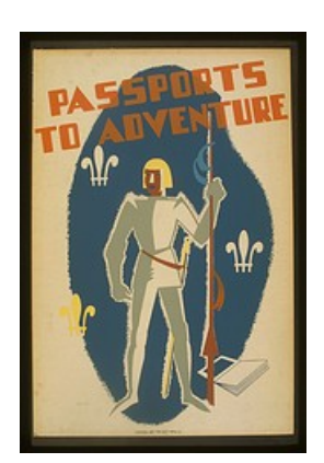
Passports to adventure

"Candidate yourself ...keep IGeLU alive ... I'm glad I did!"