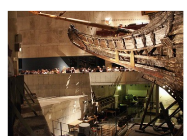
Social event at the Vasa Museum, IGeLU 2006.

Ex Libris is working in conjunction with the National Library of New Zealand to develop a revolutionary end-to-end trusted digital preservation system for preserving national cultural heritage collections. The two parties have reached beyond the immediate Ex Libris customer base to work with an international peer review group (PRG) made up of recognized thought leaders and innovators from library and academic communities. The PRG serves as an independent resource, consulting on the scope and design of the initiative and its compliance with emerging industry standards. The group's participation will help ensure that the system conforms to general access and archiving trends so that it may be broadly applied.