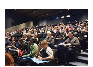
Auditorium IGeLU 2006 in Stockholm.

Product-specific questions should also be submitted on this form, but these should be sent to the Product Coordinator.