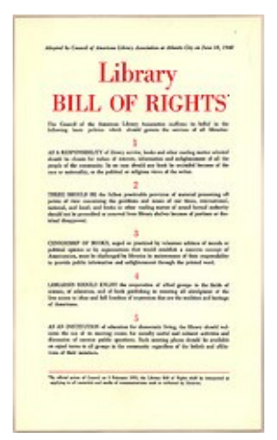
ALA Bill of rights 1948