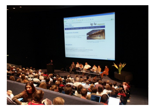
IGeLU SC at IGeLU 2006 in Stockholm.

All the newly elected members of the SC will stay in charge for a two-year term.