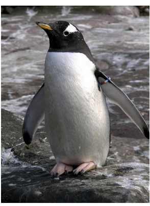
Penguin posing

Pictures have to do with identity, this is what we have understood already, and how hard it is to reflect the identity of our Association with one picture only. Maybe we'll need more than one, maybe we'll need more flexibility. The current idea is to have a picture bar – with our own pictures. They may change from time to time ... depending on our activities, the season and the side of our identity we want to stress more ... Here you may see also penguins and igloos once in a while. Discussion is still underway.