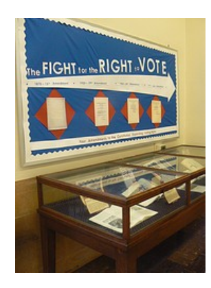
Fight for the right to vote

Thank you very much for your cooperation!