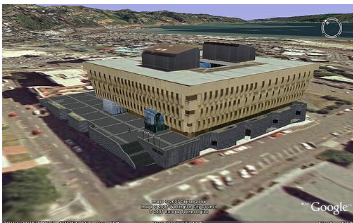
National Library of New Zealand Model on Google Earth

So if any of these issues sound familiar, come along to the plenary and panel sessions to learn about the newest Ex Libris system and how this type of development may impact upon your own library or work area.