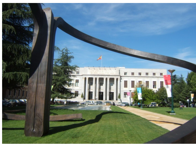
CSIC's central building.

The network is managed by the CSIC's Libraries Coordination Unit, which is in charge of the coordination and development of the network as well as of the automation processes control and management.