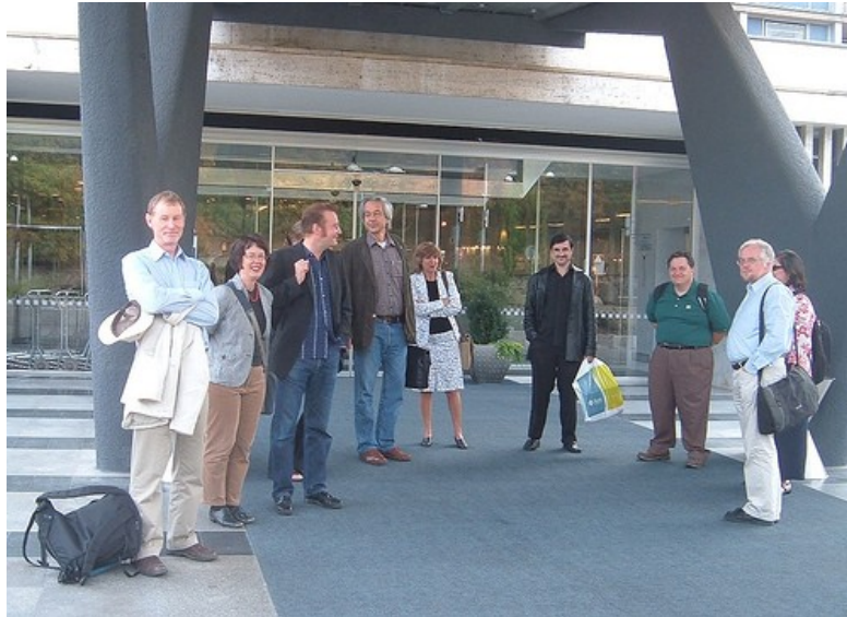
Some members from the Steering Committee and of the Product Working Groups at the 2 nd IGeLU Conference in Brno

More on all this in Madrid, see you there soon!