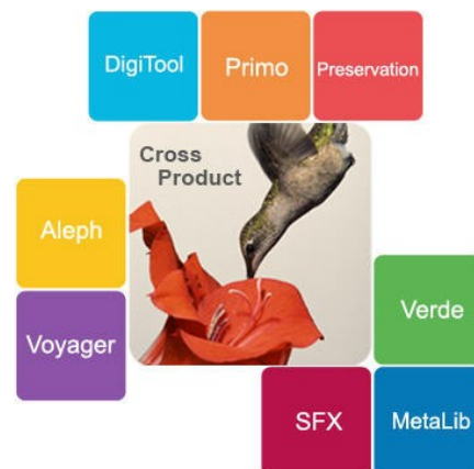
Part of EL Commons

We are happy that we have managed to organize this new collaboration platform. However, it is only a framework; it is now up to you and me as part of the user community to make use of it.