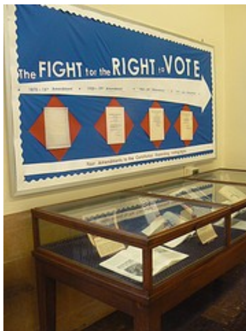
The fight for the right vote

Thank you very much indeed for your time