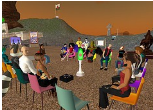
Next Steering Committee?