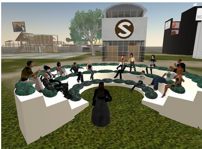
Discussion of elections in Second Life

"... we have organized a 'proxy vote engine' with a form to fill in that will only take a few minutes of your time! ..."