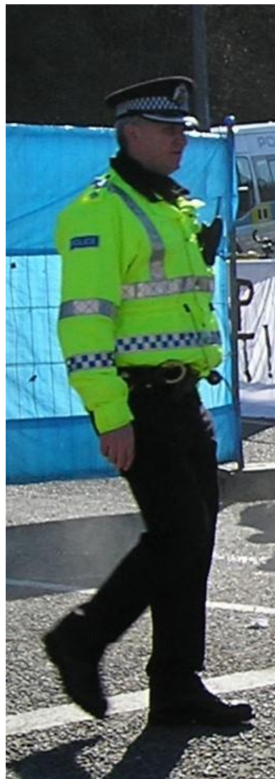
Another dancing policeman

The next day I was first in line at the British consulate and was given an emergency passport to get me home. Although it was very official and Frightfully British I couldn't quite believe that I was going home with only a sheet of A4 as my ID. I needn't have worried. As soon as they saw my emergency passport all the airport staff were very, very sympathetic. I got home as planned.