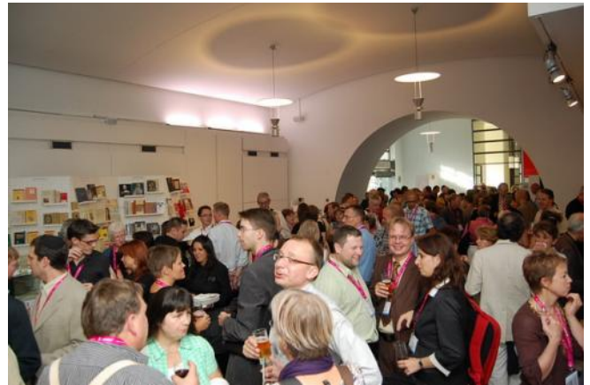
A crowded opening ceremony on Sunday

SFX Product Group related questions, comments, or recommendations are welcome and can be sent to sfx@igelu.org .