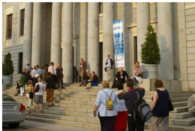
Entrance to the Conference Venue