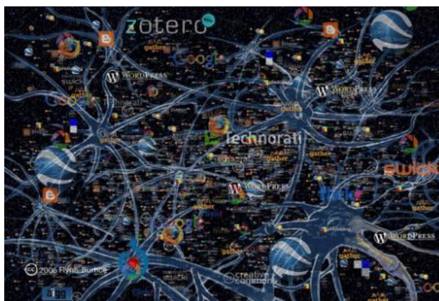
Next generation