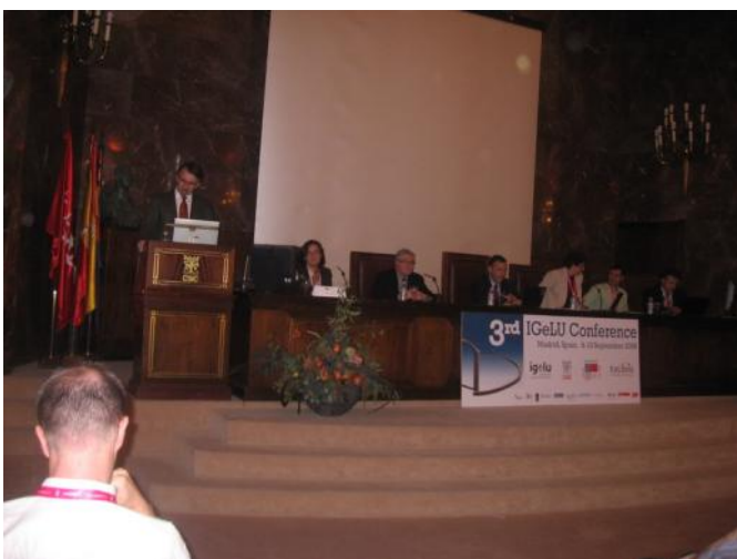
Questions & Answers