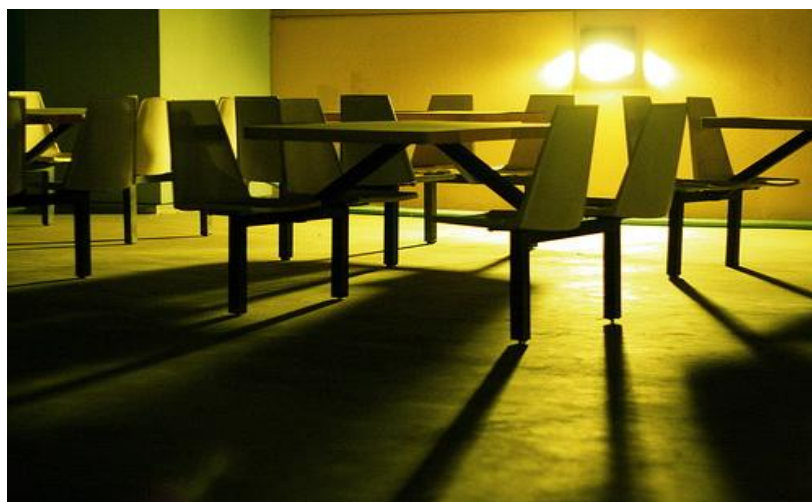
URM

The discussions that were initiated in Madrid continue to have an effect. We shall have to give some serious thought to our workflows and procedures and concretise our “motivation for change”. At this third IGeLU conference ExLibris shared their ideas with us with rare openness. We should take up their offer of dialogue and use every opportunity to give ExLibris access to our discussions, not least in order to structure the transition period together and to smooth the paths of migration. It is an exciting discussion.