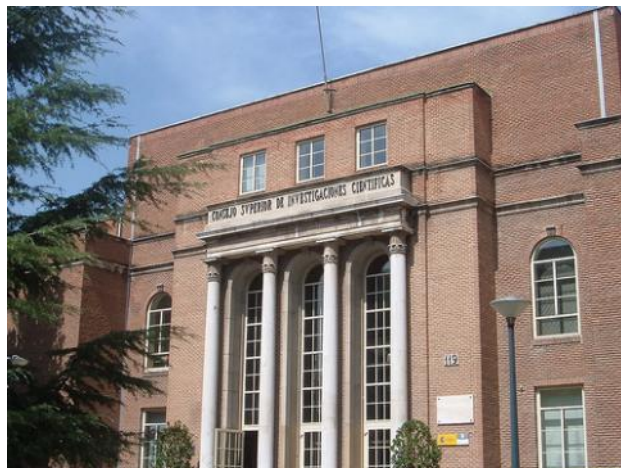
CSIC

— Regarding the first comment, the SC agrees. We do need to publish the information about the candidates prior to the meeting and we will work on making that happen next year. Regarding the second question, does the membership want to have SC and PWG leaders who are not present at the conference or who cannot be present? How can we have leaders who don’t attend the conference? That being said, however, we may need to consider how members who can’t attend the conference can still contribute to the work of the organisation and its various groups. Any suggestions on this subject are very welcome.