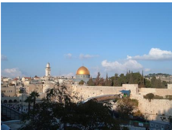
Dome of the Rock (Lukas Koster)

The last part of the two days was used for summarizing and discussing a number of more general issues, mainly focused on the structure of the EL Commons platform. All attendees agreed that EL Commons needs more content, better internal and external integration, and a more vibrant and active community. While there were many ideas on how to accomplish this goal, there will need to be more discussion on how to drive participation. Everybody agreed that the meeting should be repeated. In order to keep these meetings as efficient as possible, we all agreed that the group should not be