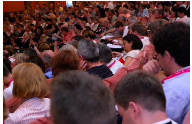
A crowded seminar on Tuesday