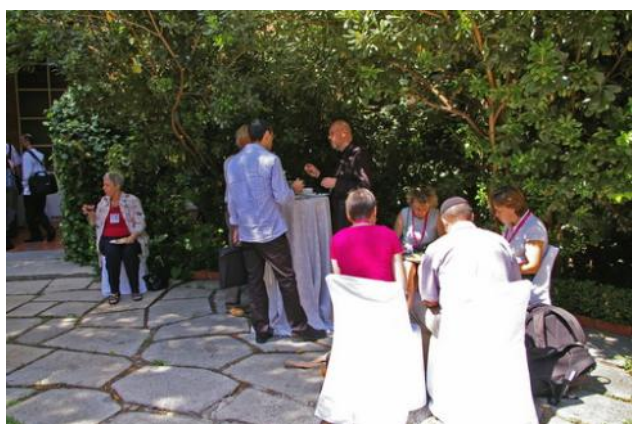
Lunch in the Cloister