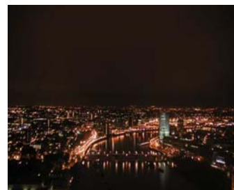
Thames by Night