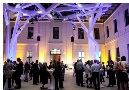
2013 IGeLU Meeting in Berlin: Social event

Any institution with a contract for an Ex Libris product can become a member of IGeLU. The annual fee is currently 250 Euro per institution. Become a member and join more than 400 other IGeLU member institutions worldwide from over 30 countries!