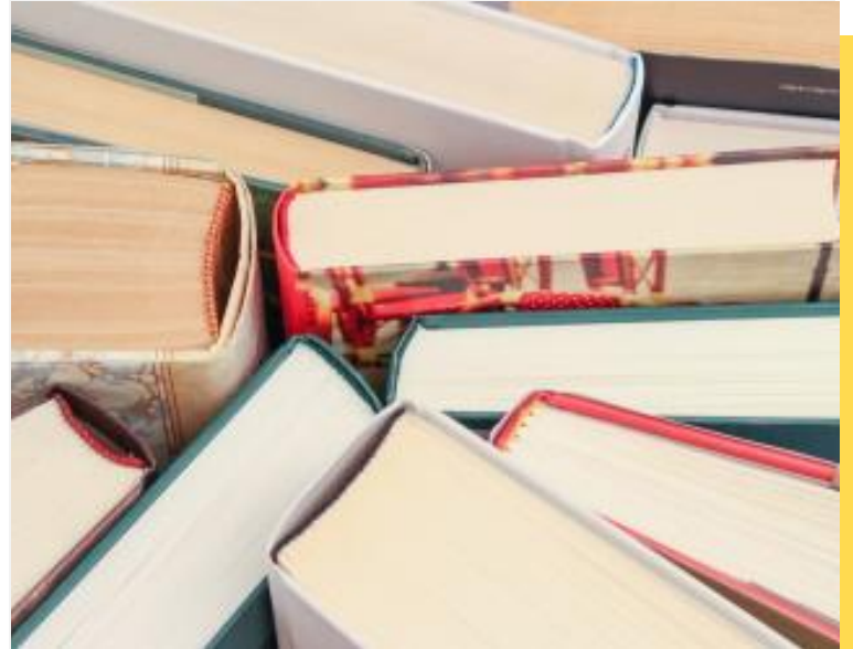
Bound books. Creator: rawpixel.com https://alacorenews.org/2022/02/03/library-binding-symposium-recording-now-available/