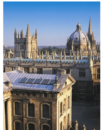
2014 Annual Meeting in Oxford, UK